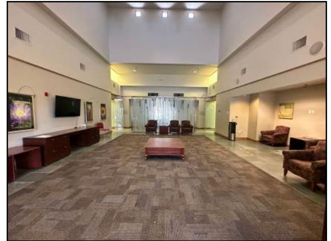
Spacious Waiting Room